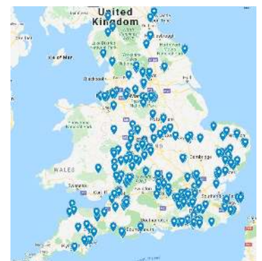
Areas with Green Councillors.

Vote Green on 6 th May to continue electing Greens and to have your voice heard.