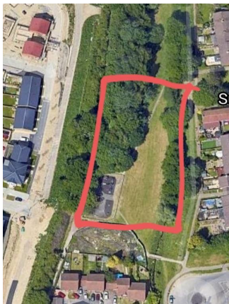
The proposed Henty Close site