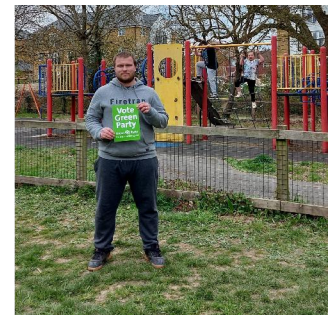
Green spaces are still enjoyed by local residents